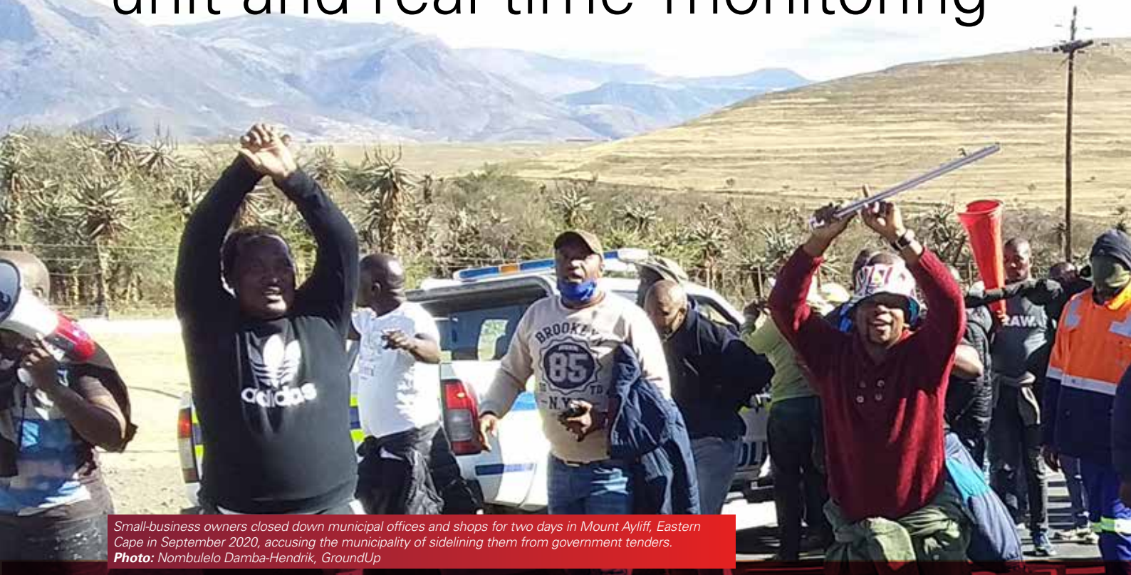
Small-business owners closed down municipal offices and shops for two days in Mount Ayliff, Eastern Cape in September 2020, accusing the municipality of sidelining them from government tenders.

Small-to-medium enterprises are an engine for economic growth in developing countries. They are, however, also disproportionately affected by state corruption. At a recent webinar co-hosted by the HSRC, delegates from the South Korean embassy and the Hankuk University of Foreign Studies shared lessons from their thriving SME sector and related the country's experiences in tackling corruption. Local researchers explored possible parallel solutions to corrupt procurement processes in South Africa. By Andrea Teagle